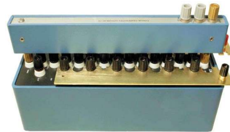
Options Shown on ESI SR 1010

These adapters are shown to the right on the older ESI SR 1010. A special Model of the GL 1010 Series is available for the US Navy (GL 1010N) as is a unique SR 1010 Adapter for the US Air Force (shown below) and other customers. A front view of the GL 1010N-10 Ohm model is shown to the left. You can see that currently developed SR 1010 procedures and adapters will work perfectly with all models in the GL 1010 Series of Transfer Standards.